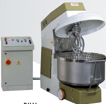
DUAL Duble tool mixer