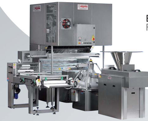
BREAD LINE For long loaves, tin bread, baguette.