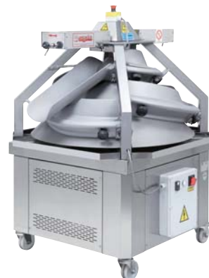
AS Conical rounder