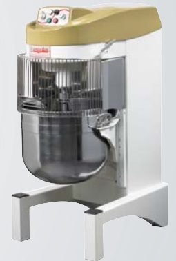
QUICK Planetary mixer