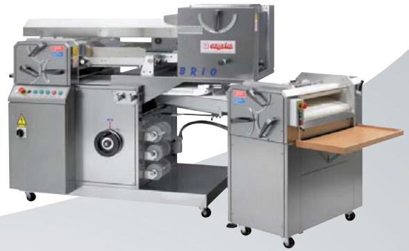
BRIO Automatic unit