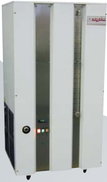
SC Water cooler