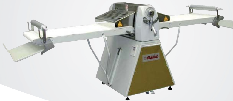
SPT3 Manual puff-pastry sheeter