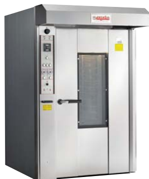
QUASAR TOP Rotating rack oven