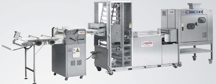
SMALL LINE Mini line for fingers rolls and hamburger