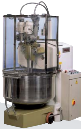
IBT Double arm mixer