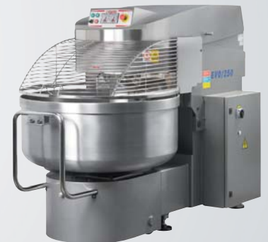
EVO Spiral mixer whit removable bowl