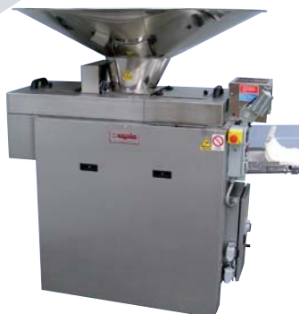
PISTON - BREAD DIVIDER