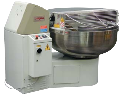
ARCA Fork mixer