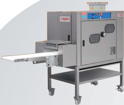
LYRA Two pockets divider rounder