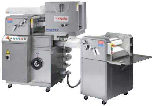
WINNER/DUETTO Automatic unit