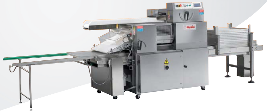
TECNA Ciabatta divider with trays loading system