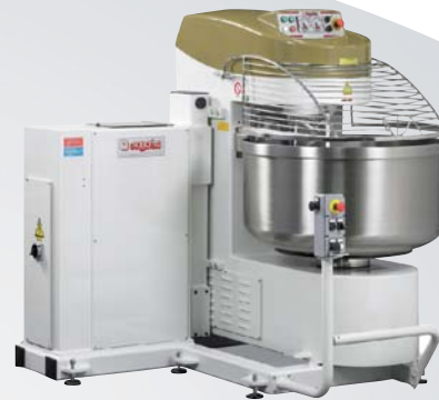
PRISMA Self-tilting mixer