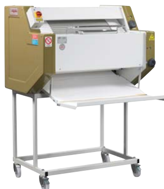
FB Baguettes moulder