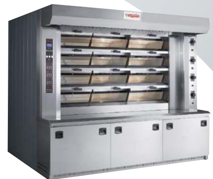
ANTARES Steam tube deck oven