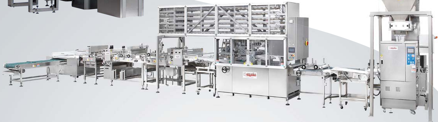
SUPER FLEX LINE - ROLL LINE For rolls, stamped bread, hot dogs, finger rolls, hoogies and baguettes