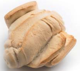
Mantovana Italian roll