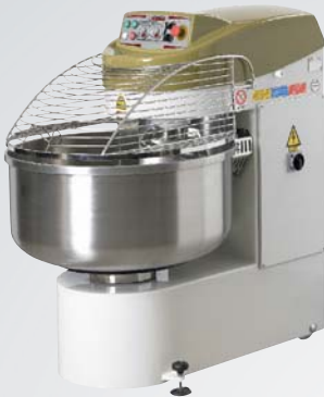
TWIST Spiral mixer