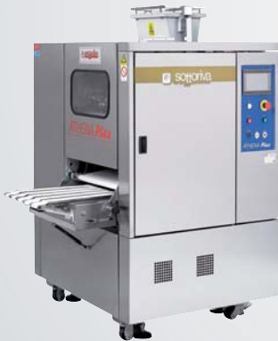
ATHENA PLUS Multipockets divider rounder