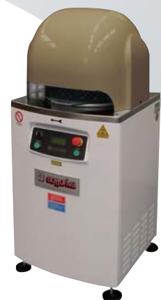
SP AR Buns divider rounder